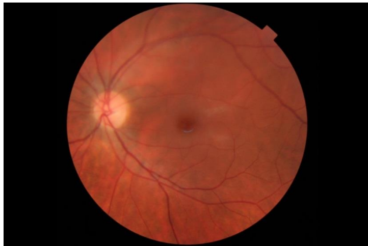
Normal retinal photograph

* The iWellnessExam is an eligible expense for Flexible Spending Accounts